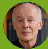
Prof. Dr. Dr. h. c. Hans Joachim Schellnhuber Director of the Potsdam Institute for Climate Impact Research